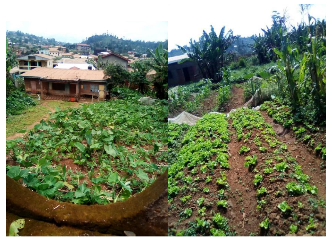
Plate 2: Urban gardens in Dschang

The use of organic manure in farming is a long aged tradition that has evolved with time. Food waste, animal droppings, wood ash and crop residues are traditionally buried into furrows where they decay to form humus. This indigenous practice which was considered as means of waste disposal has improved on food production practices and yields. In the last two decades, this traditional composting by small farmers has been replaced by chemical fertilizer in pursuit for greater yields.