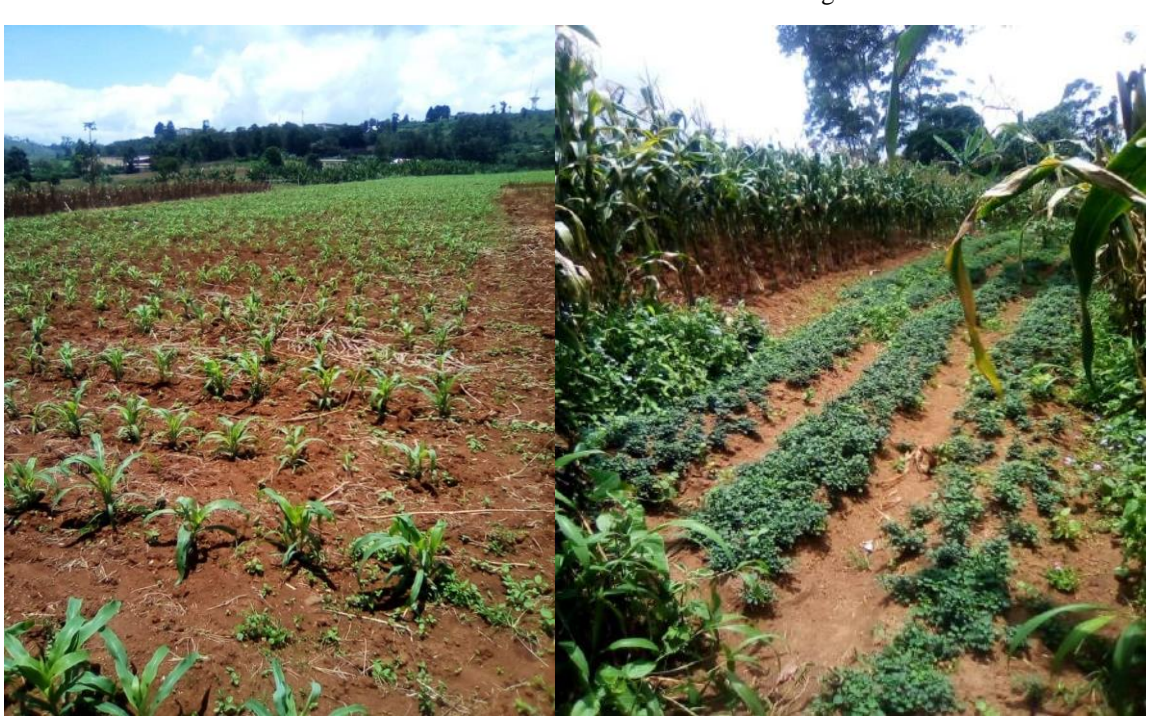
Plate 1: Urban farms in Dschang town

Urban farms are generally larger parcels of land (more than a hactare) occupied mostly cereals (Plate 1). The use of chemical fertilizers is still common with urban farms, where farmers either use for specific crops such as maize or associate with organic manure.